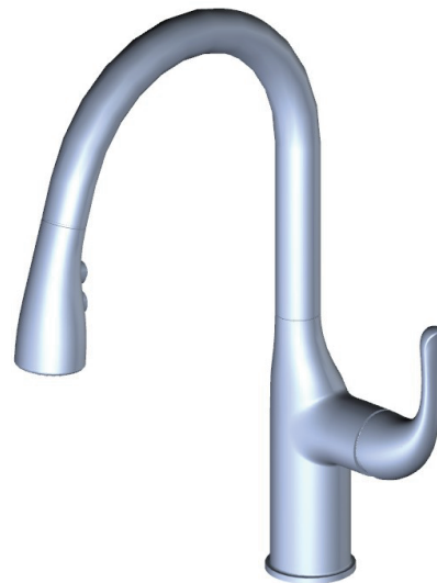
Sensor Kitchen Faucet